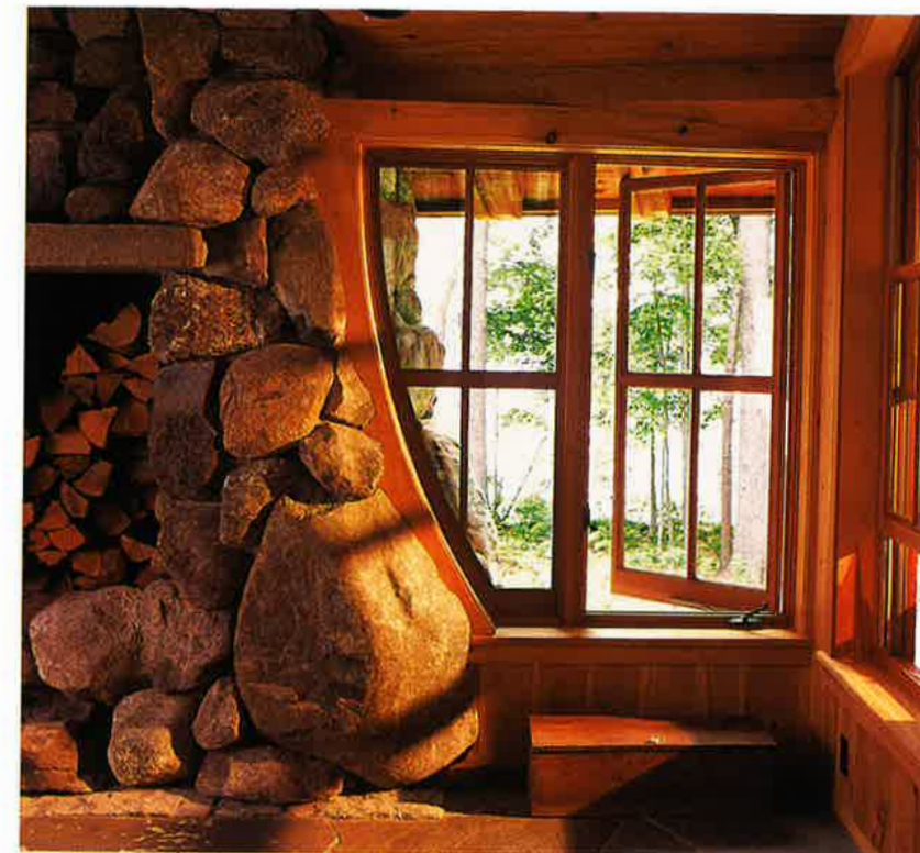
The custom-tailored Douglas fir window frames and triangular glass fit the rounded contours of the stone fireplace.

The central part of the camp, which the owners call the main camp, is accessible by a covered entry that is marked by a slab of cut stone placed intentionally to blur the transition between indoors and out. It also creates a sheltered spot where family and friends convene early in the morning to enjoy the first sights and