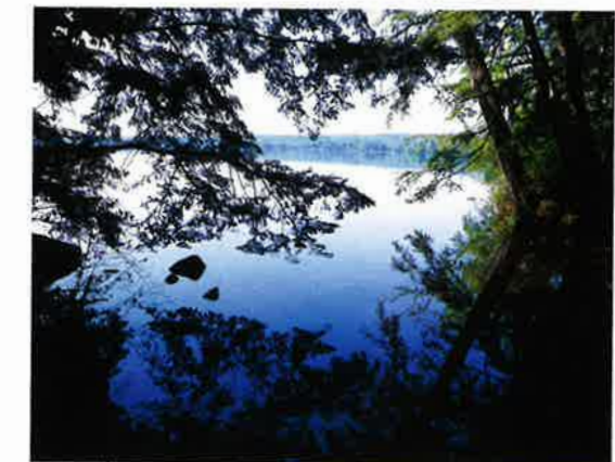
After years of searching, the homeowners found the perfect spot for their retreat in central Maine, a 12-acre parcel of land along an undeveloped lake and a small stream that flows into the lake.

Besides the office in the bunkhouse, there are also three bedrooms on the main floor. To complete the guest space, there's an auxiliary kitchen—with green cabinets painted the color of local hemlock trees—so visitors can brew their morning coffee.