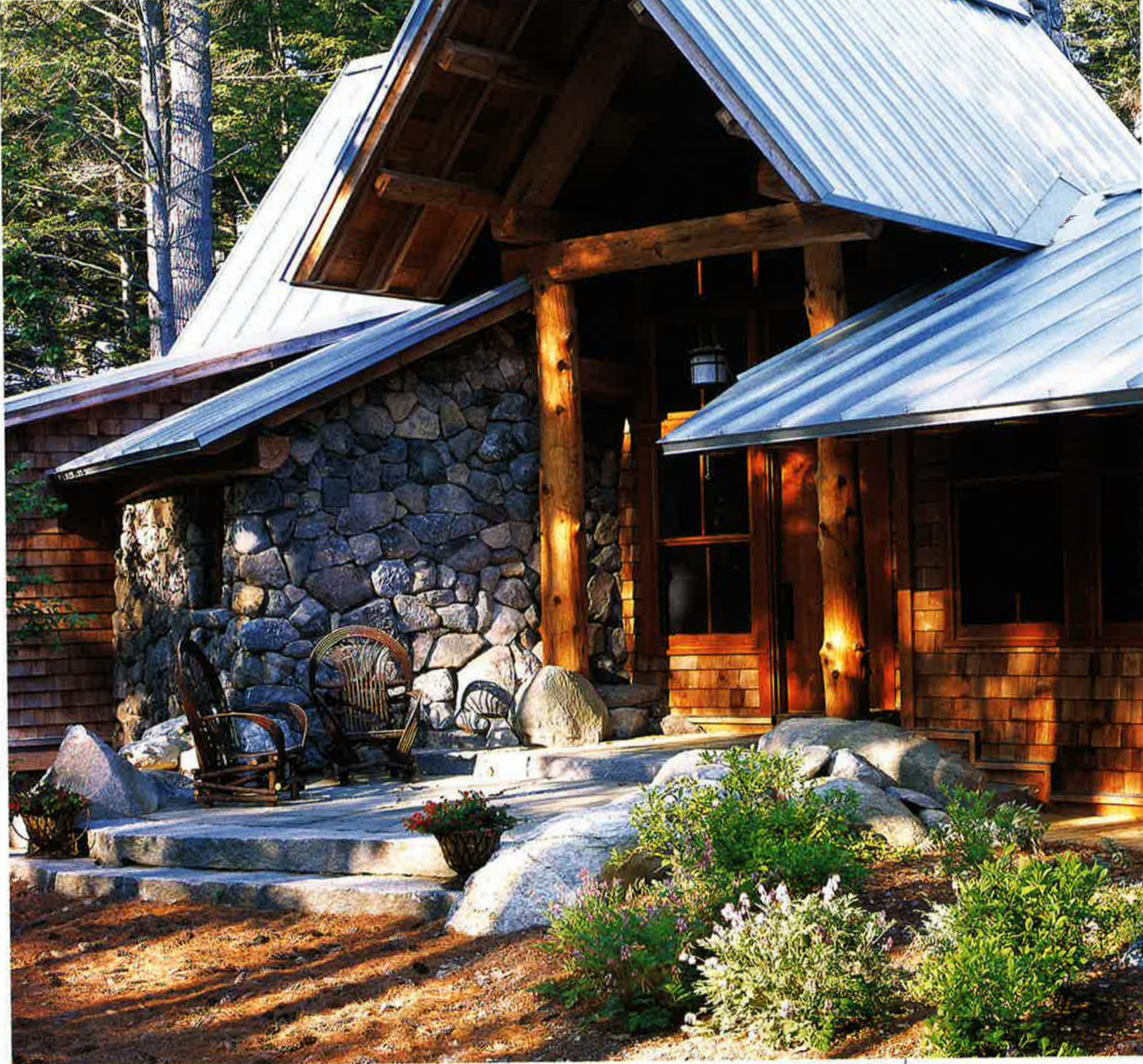
A steep, sheltering roof over a stone terrace establishes the entrance to the main cabin.

A series of wooden hooks on the lake-side of the house is the place to hang up life vests and other gear after a day at the lake.