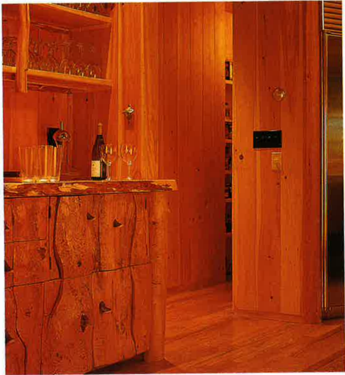
One of the cabinets in the main cabin is handcrafted with chunky, rough-hewn birch. The cabinet naturally fits into the setting.

scents of pine trees and to experience the rising sun before heading inside for a hearty breakfast.