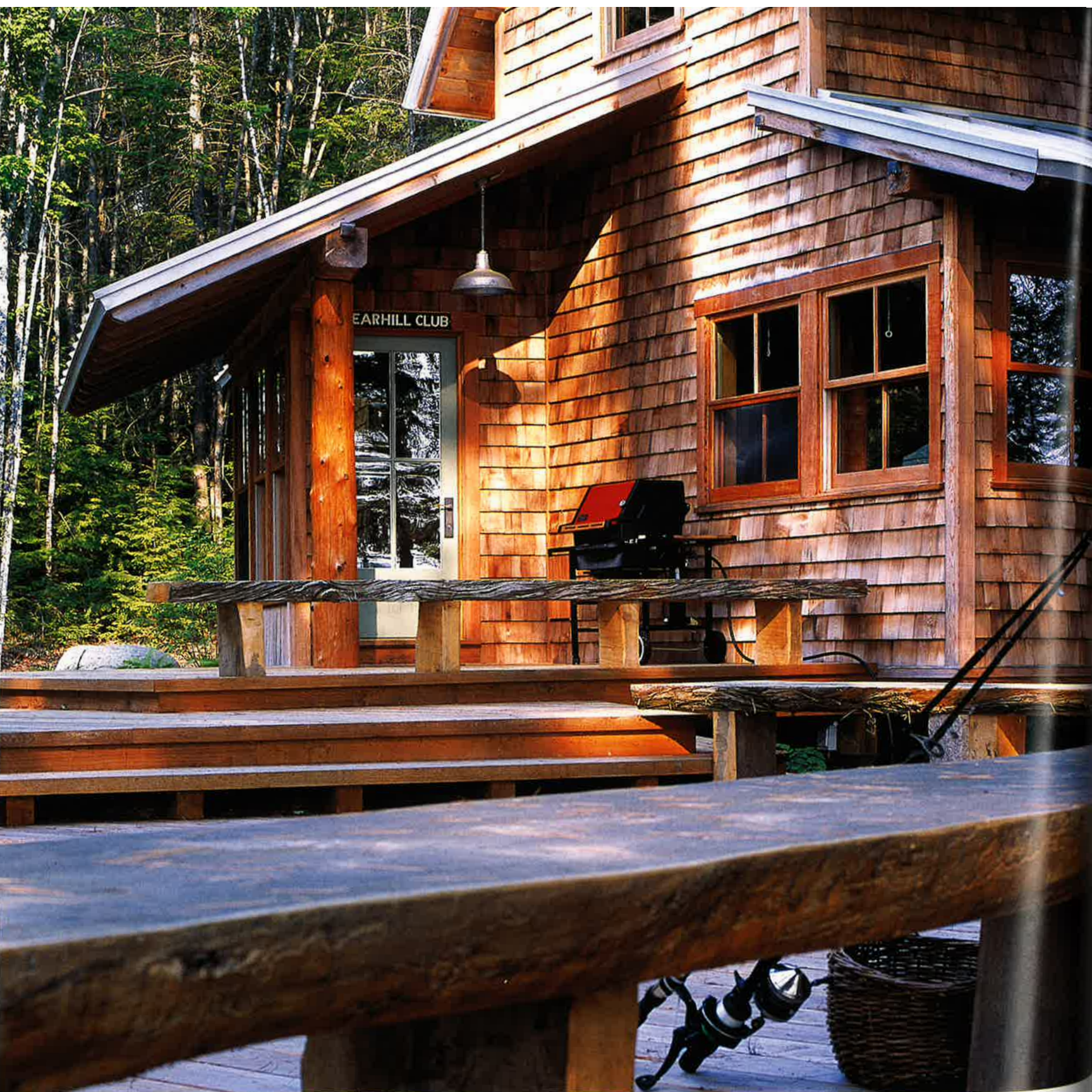
An outdoor mudroom at the entrance to the bunkhouse includes a built-in bench where guests can take off their shoes. The terrace in the foreground between the main cabin and guest cabin is the homeowners' favorite gathering space.

differ from those of olden lodges. Even the wood used—roof trusses of fir and plank wood flooring of light-colored white oak—adds to the brightness of the interior.